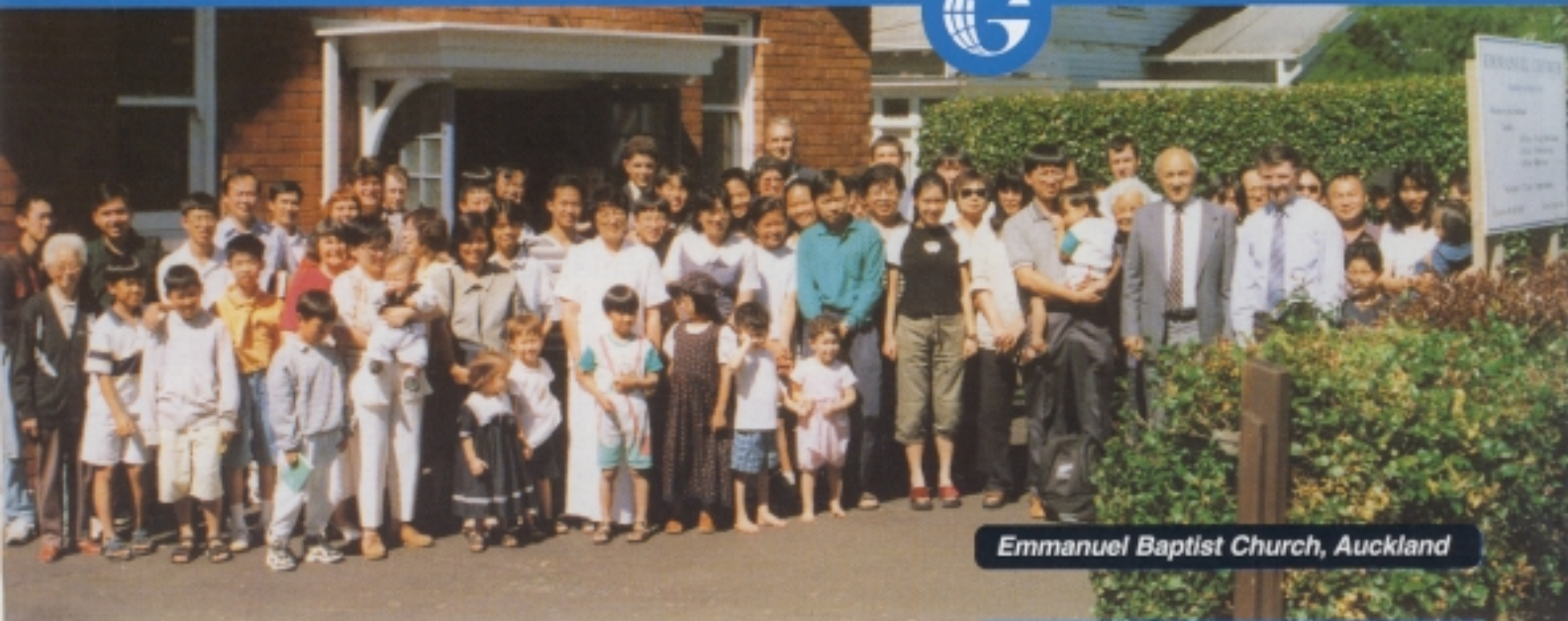
Emmanuel Baptist Church, Auckland